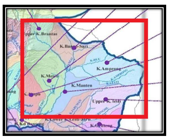
Figure 2 Area of Study

Brantas river watershed classified into 36 sub watershed and bypasses 9 districts/cities in East Java. Location of study as follow in tabel 1 and figure 2