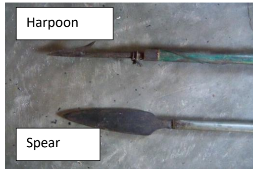
Picture 2. Spear and Harpoon, equipment used during traditional hunting process

Once all nets have been installed, the dogs will chase the timor deers so that they go out of the forest or bushes where they hide. The more dogs join the hunting process, the more likely it is to catch timor deer because the timor deers are afraid of the dog's bark. The timor deers will walk out from the forest and be caught in one of the nets. Nowadays, Baar people use fewer dogs for hunting due to their religion. Moslem people do not usually keep dogs as their pets. As the result, dog population in the area keeps decreasing and fewer dogs join the hunting process.