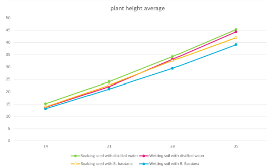
Figure 2. The mean height of soybean plants

[11]. This may suggest that the ability and of endophytic fungi to enhance the growth of host plant is likely depend on the compatibility of endophytic fungus and host plant. Our result showed there was no significant different on the growth of soybean plant between treated and untreated plant with endophytic fungi, B. bassiana . This may be caused by B. bassiana may not have high compatibility with soybean plant thus could not increase the growth of plant significantly. However, further research still need to be conducted.